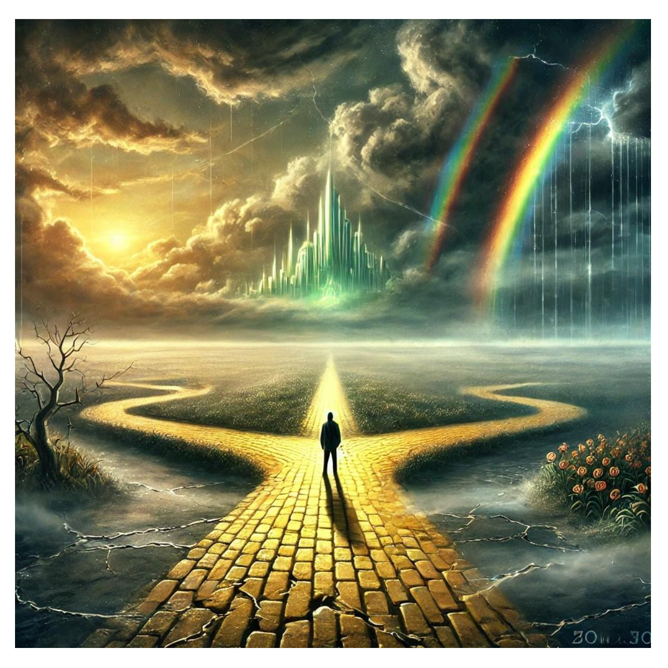
PSALMS 23 THE LORD IS MY SHEPHERD I SHALL NOT WANT HE MAKES ME TO LAY DOWN IN GREEN PASTURES HE LEADS ME BESIDE STILL WATERS HE RESTORS MY SOUL AND LEADS ME BACK ON A PATH OF RIGHTUSNESS FOR HIS NAME SAKE. YEA THOUGH I WALK THROUGH THE VALLEY OF THE SHADOW OF DEATH I SHALL FEAR NO EVIL. THY ROD AND THY STAFF COMFORT ME, YOU HAVE PREPARED A TABLE BEFORE ME IN THE PRESENCE OF MY ENEMIES YOU ANOINT MY HEAD WITH OIL MY CUP RUNS OVER SURELY GOODNESS AND MERCY SHALL FOLLOW ME ALL THE DAYS OF MY LIFE AND I SHALL DWELL IN THE HOUSE OF THE LORD FOR EVER AND EVER...AMEN