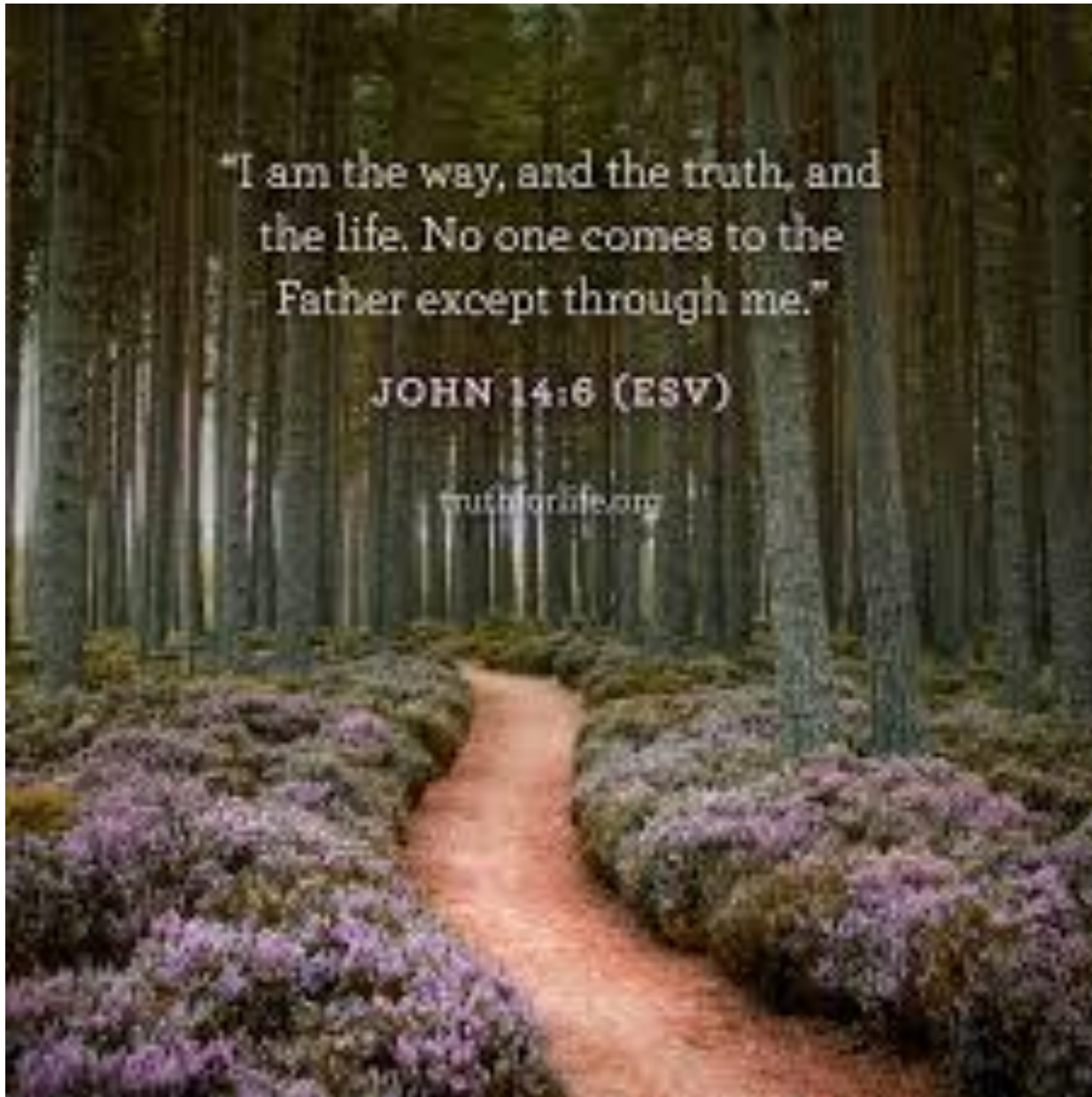
The 7 I AM statements in the Gospel of John

This is humanity's way out of the forest of sin and despair. May we continue to shine as lights in this dark and broken world. Amen.