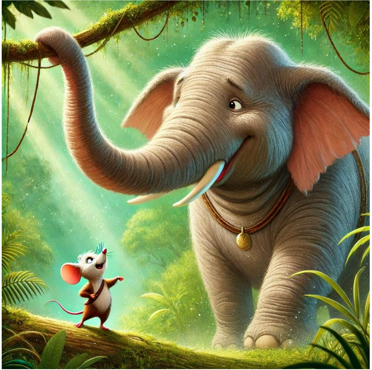
Fomba and Kenneth Facing an Adventure Together