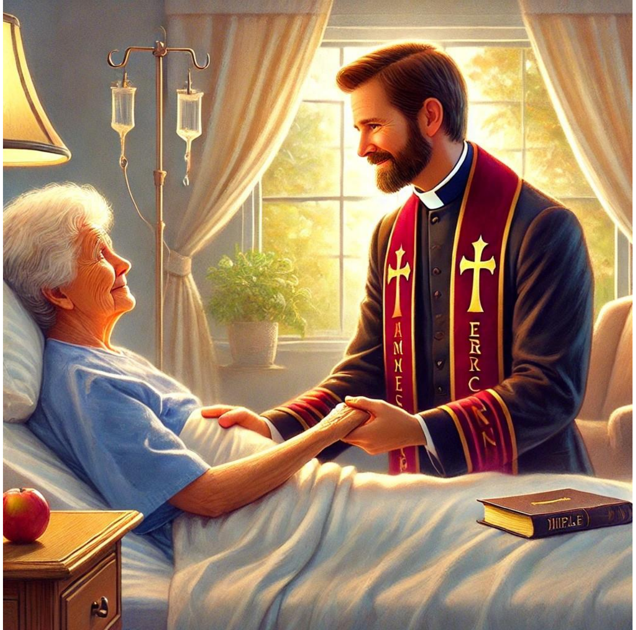
Chaplain America Comforting a Patient