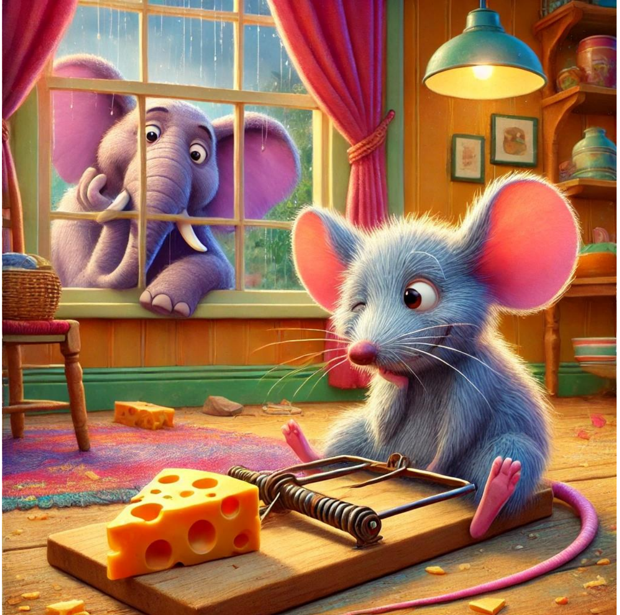
Kenneth the Mouse in a Humorous Predicament